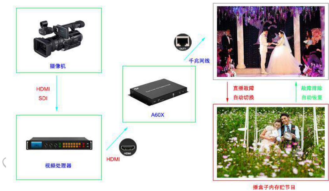
Display camera images synchronously